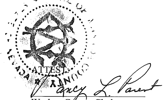
Washoe County Clerk