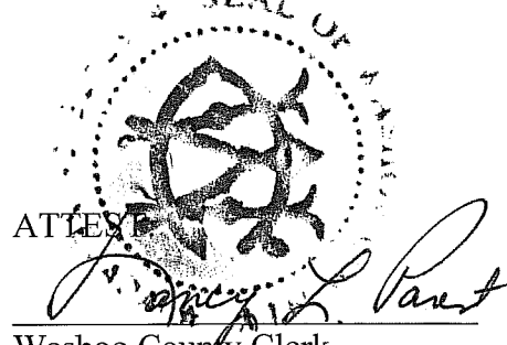
Washoe County Clerk

ADOPTED this 17th day of December, 2013.